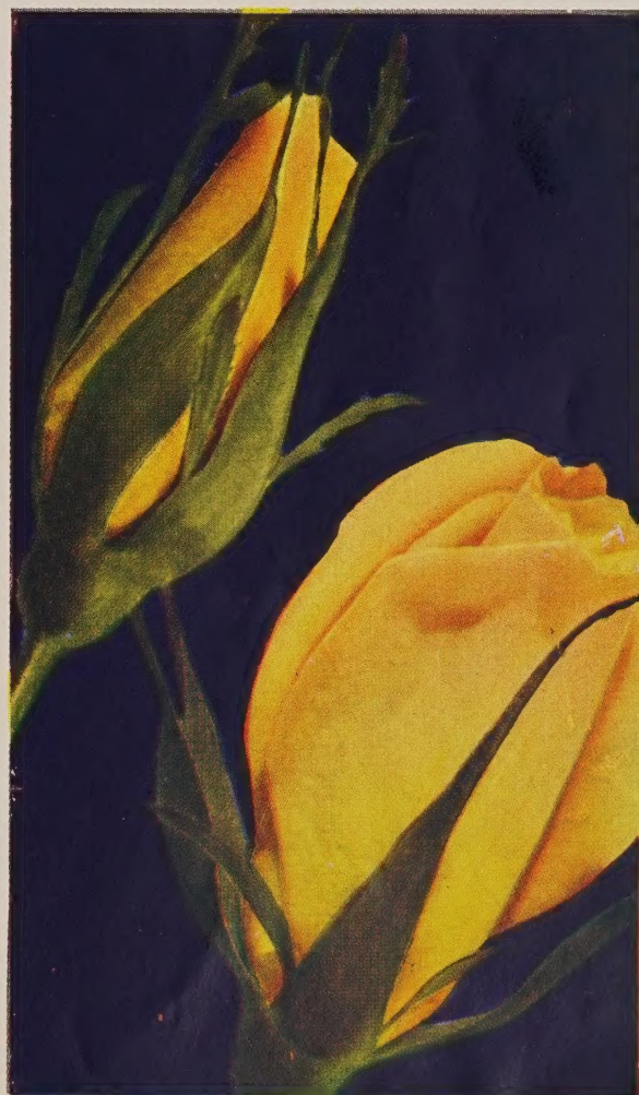
COPYRIGHT ECLIPSE—$1.25 each; 3 for $3.15 (Plant Patent No. 172)